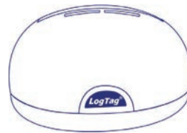
LTI HID Not Included