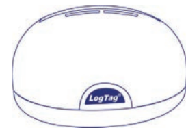
LTI-HID Not Included